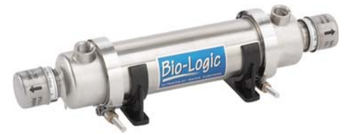
Model BIO-1.5 1.5 GPM

The Bio-Logic® has been carefully conceived to provide adequate germicidal dosage throughout the disinfection chamber.