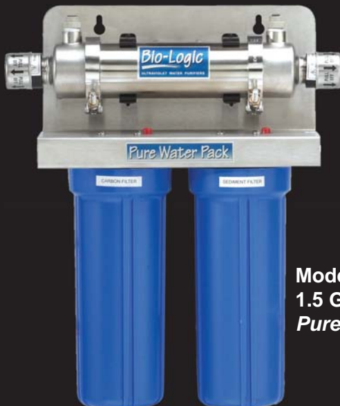
Model BIO-1.5 1.5 GPM with Pure Water Pack ™