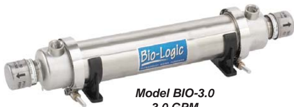
Model BIO-3.0 3.0 GPM