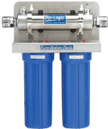
Model BIO-1.5 PWP 1.5 GPM